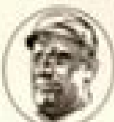
8. HENRY CAMPBELL