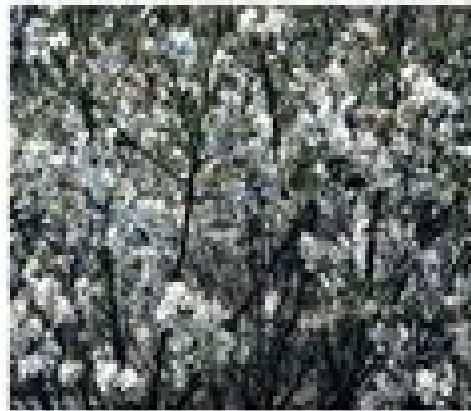
flower: apple blossom