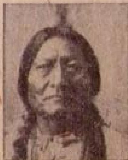
Chief Sitting Bull

Little Big Horn, Sitting Bull escaped to Canada, but returned to the United States after being promised a pardon. He then appeared in Buffalo Bill's Wild West Show, but lately he has been urging the Sioux not to sell their lands.