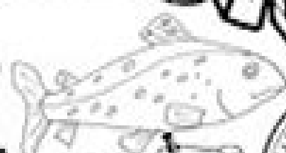
State Fish Arizona Trout