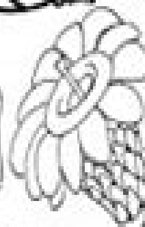
State Flower Saguaro Cactus Blossom