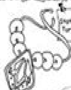
State Gem Turquoise