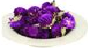
Gomphrena globosa L.