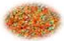
Calendula officinalis L.