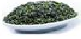
Lavandula angustifolia Mill