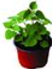
Agastache foeniculum (Pursh) Kuntze