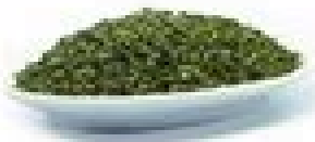
Thymus mastichina L.