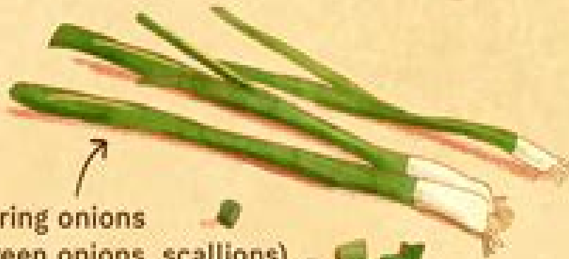
Spring onions (green onions, scallions)