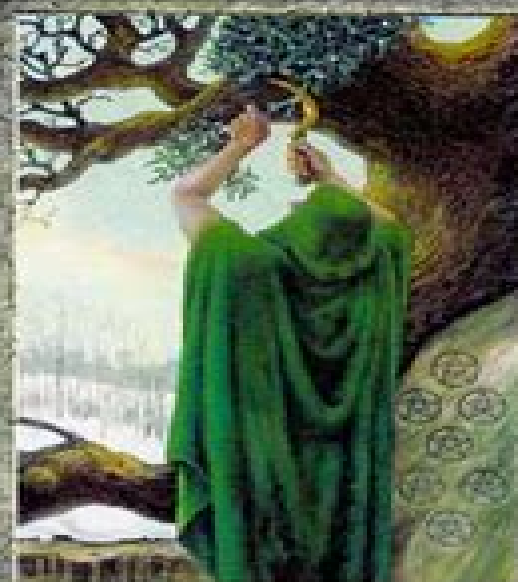
SEVEN OF PENTACLES