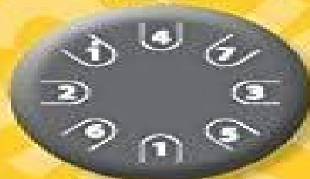
8 note diatonic