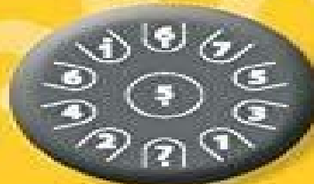
11 note diatonic