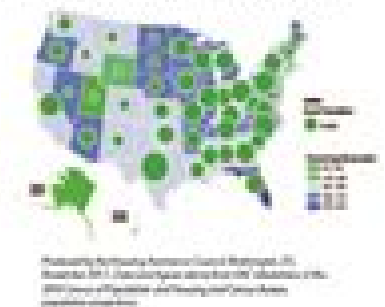
Rural & Small Town Senior Population by State, 2010

25% of seniors in the U.S. live in Rural America