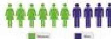
Rural Seniors by Gender, 2010