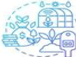
SPENDING ON CLIMATE