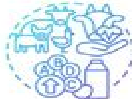
FOOD & HEALTH