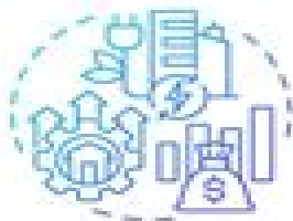
PROMOTE SMART VILLAGES