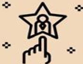
Representing the brand