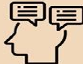
Communicating ideas perfectly