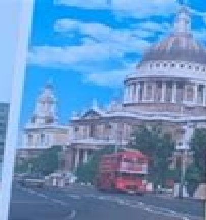
St. Paul's Cathedral