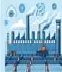
Supply Chain Optimization