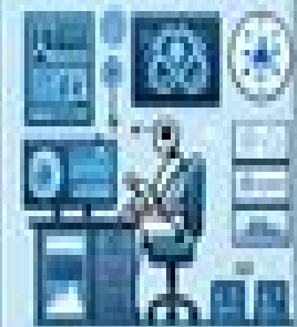
Supply Chain Optimization