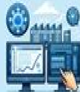
Energy Cost Efficiency