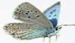
Dutch Alcon Blue Butterfly