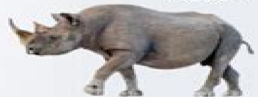
West African Black Rhinoceros