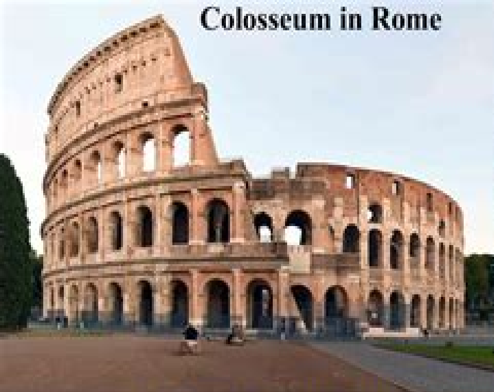
Colosseum in Rome