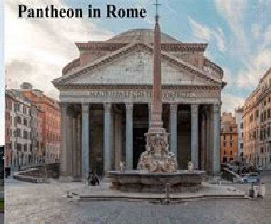
Pantheon in Rome