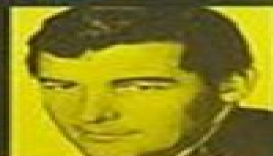
BRIAN KELLY estrella de "Flipper"