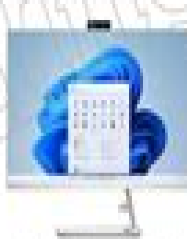
All-in-One (AIO) Computers