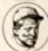
10. GEORGE CROFT