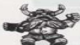
Deathroller Driver 099901901