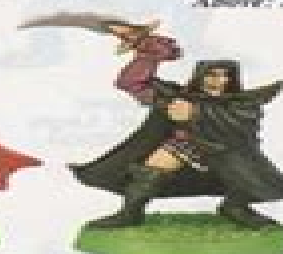
Horkon Heartripper 099901601