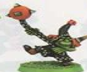
Fungus the Loon 099902101