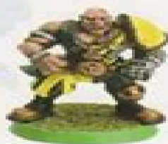
Mighty Zug 099901301