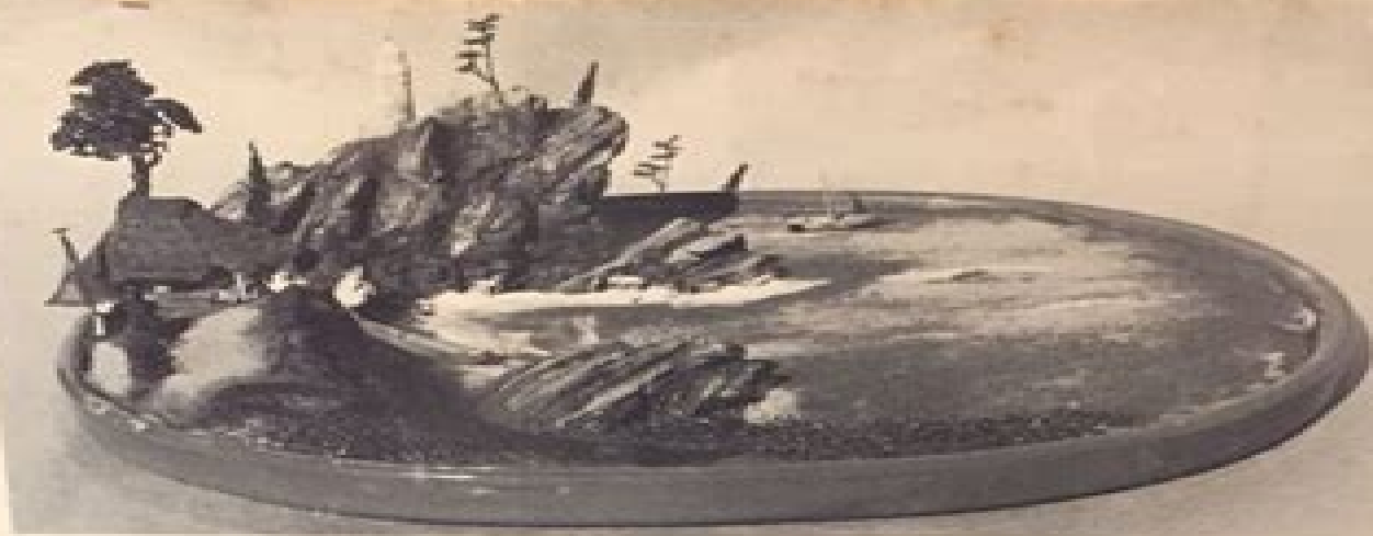
Above. Tray landscapes are an interesting aspect of bonsai. This saikai, a coastal scene made with artificial materials, is copied from a picture in a book of famous Japanese landscapes. Below. The author shows how to plant a newly-pruned tree in a container with a rock for stability. This is one of many step-by-step pictures illustrating the basic techniques of bonsai.