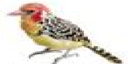
Red and Yellow Barbet