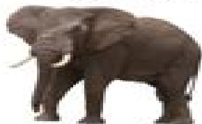
African Savanna Elephant