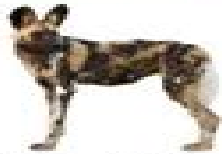
African Wild Dog