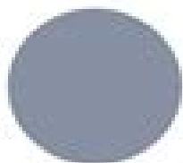
Benjamin Moore Flower Box