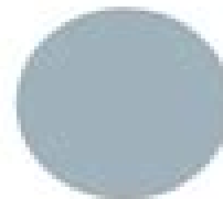
Sherwin-Williams Dockside Blue