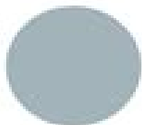
Benjamin Moore Santorini Blue