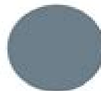
Benjamin Moore Normandy