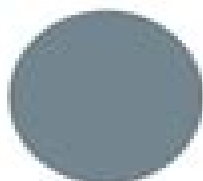
Behr Adirondack Blue