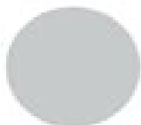
Sherwin-Williams Gray Screen