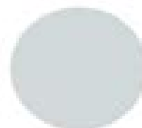
Benjamin Moore Blue Lace