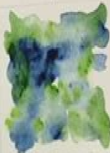
Wet-in-Wet & overlay