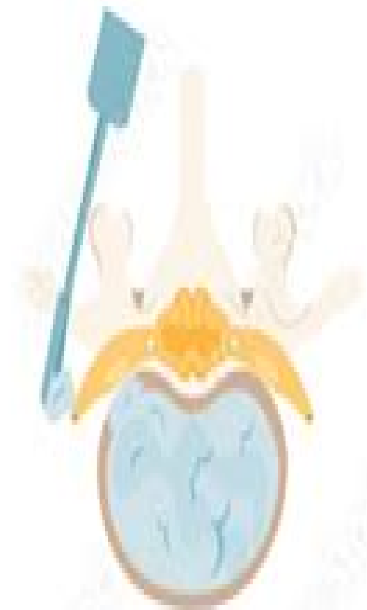
Herniated Part Of Disc Is Removed