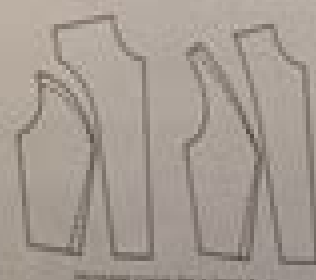
Increased curve for a large bust

The increase or decrease for fitting should be taken on the side front piece, shaping the center front as is.