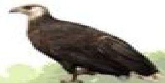
Madagascar Fish Eagle