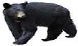
American Black Bear