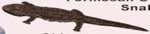
Chinese Giant Salamander