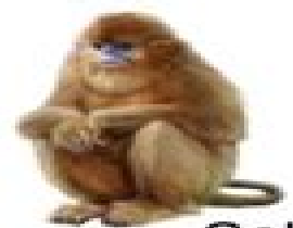
Golden Snub-nosed Monkey