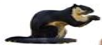
Black Giant Squirrel