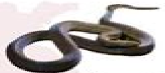
Formosan Odd-scaled Snake