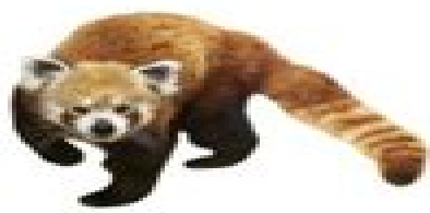
Himalayan Red Panda