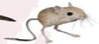
Mongolian Five-toed Jerboa