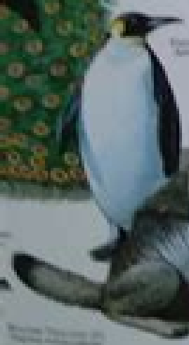
Adelie Penguin Adelie penguin