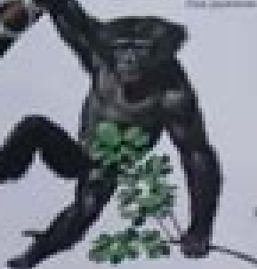
Mountain Gorilla Gorilla gorilla