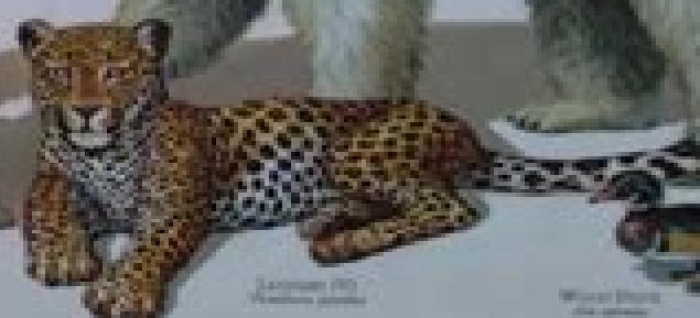
Leopard Panthera pardus