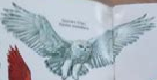
White Eagle Haliaeetus albicollis