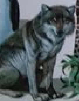
Gray Wolf Canis lupus