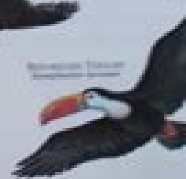
Scarlet Macaw Ara macaw