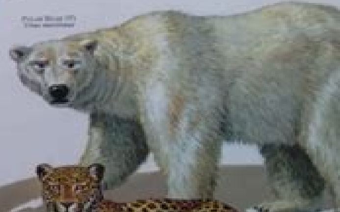
Polar Bear Ursus maritimus