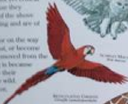
Scarlet Macaw Ara macaw