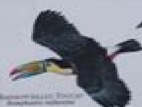
Scarlet Macaw Ara macaw