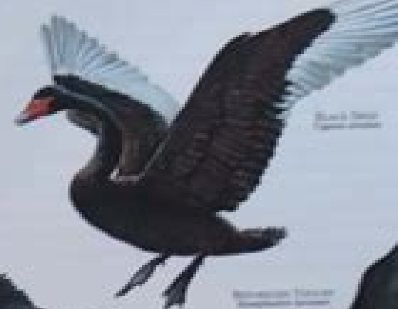
Black Swan Oxyechus