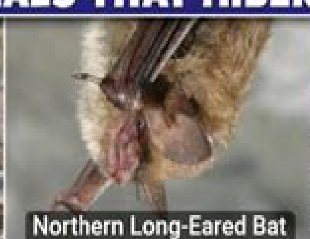
Northern Long-Eared Bat