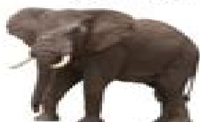
African Savanna Elephant