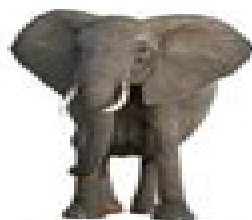
African Bush Elephant