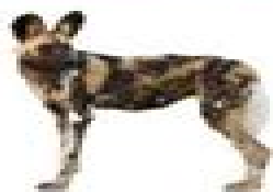
African Wild Dog