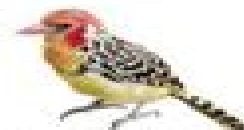
Red and Yellow Barbet