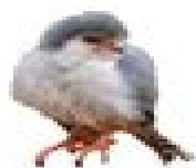
African Pygmy Falcon