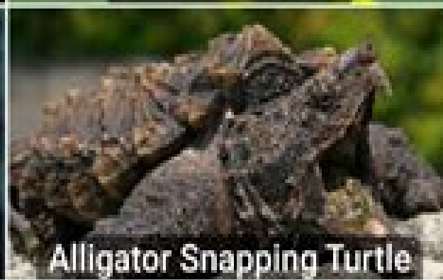
Alligator Snapping Turtle