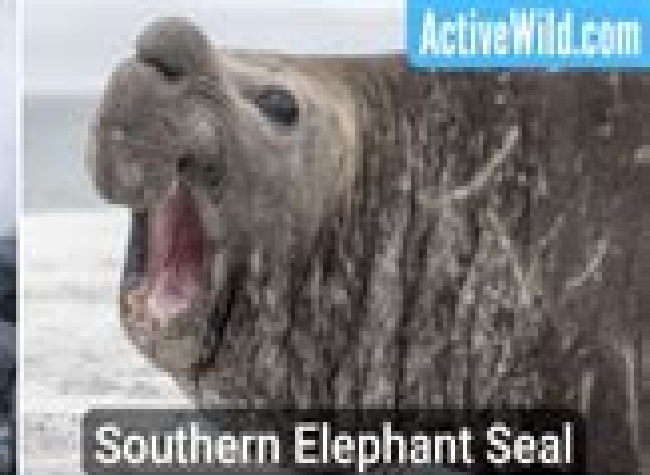
Southern Elephant Seal