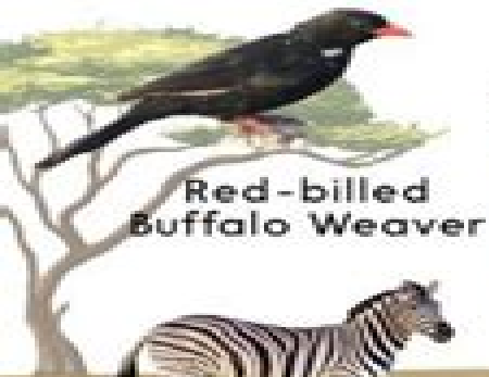
Red-billed Buffalo Weaver