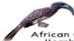
African Grey Hornbill