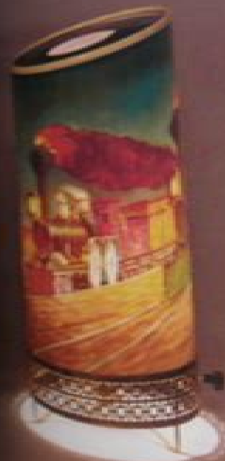
Trains Racing 1957 LA Goodman Chicago, IL 17" Plastic 825 - 843