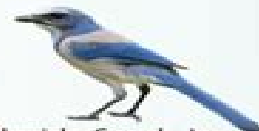
Florida Scrub Jay