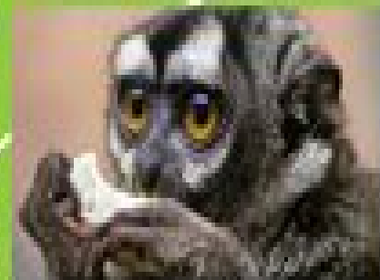
6. ANDEAN NIGHT MONKEYS