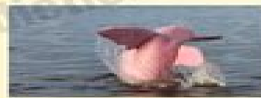
Pink river dolphin