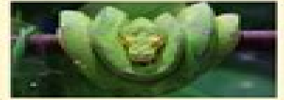
Green tree python