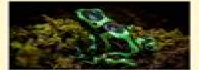
Poison dart frog