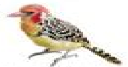
Red and Yellow Barbet