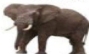
African Savanna Elephant