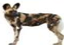
African Wild Dog