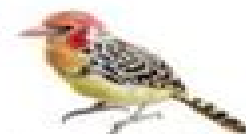
Red and Yellow Barbet