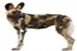
African Wild Dog