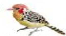
Red and Yellow Barbet