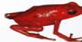
Splendid Poison Frog