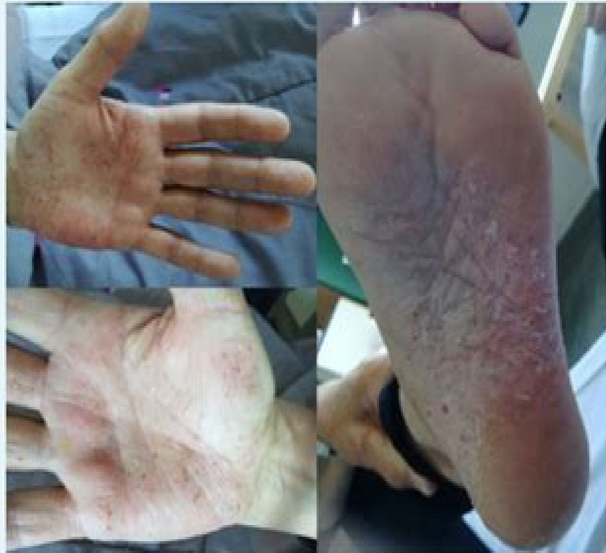
Figure 1. Skin lesions of both hands and feet