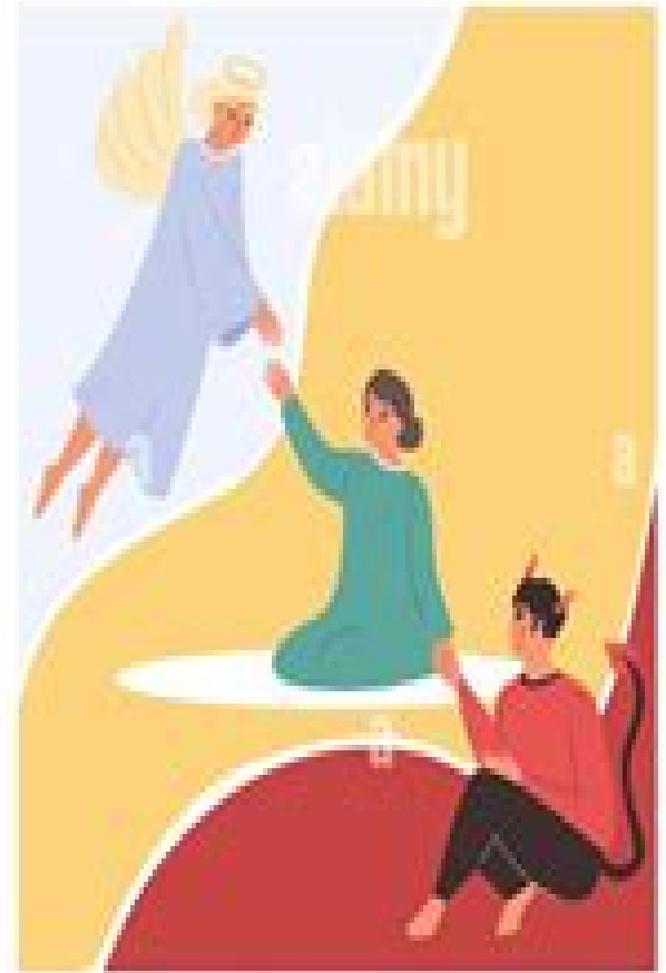
HEAVEN AND HELL