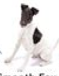
Smooth Fox Terrier