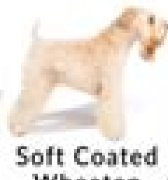
Soft Coated Wheaten Terrier