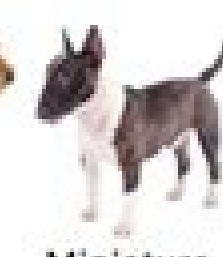
Miniature Bull Terrier