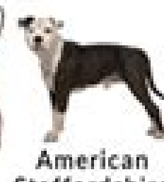
American Staffordshire Terrier