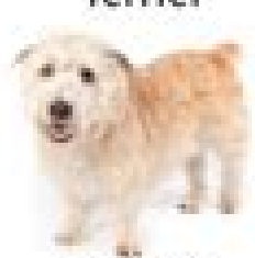
Glen of Imaal Terrier