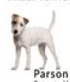
Parson Russell Terrier