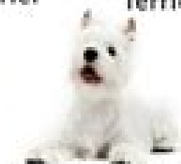
West Highland White Terrier