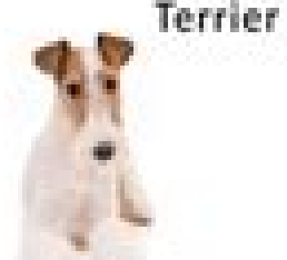
Wire Fox Terrier