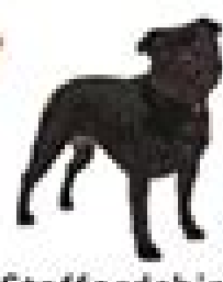
Staffordshire Bull Terrier