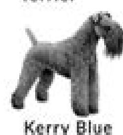
Kerry Blue Terrier