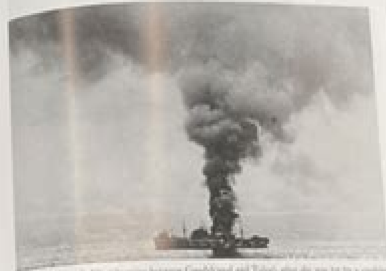
The USS George F. Elliott (LST-1123) burning on the water at Guadalcanal and Tulagi, after she was hit by a sinking Japanese aircraft during an air attack on 8 August 1942.