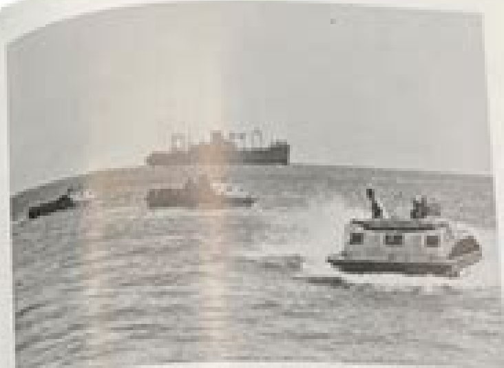
USS Marine Corps (LST-1123) unloading supplies onto the beach at Guadalcanal Island, during the 1st August 1942 aerial landings.