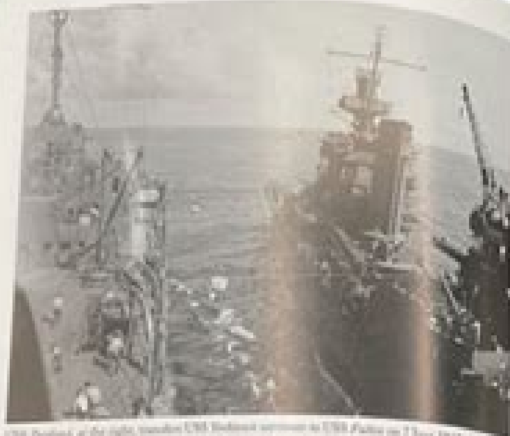
USS Peacock, at the right, unloads USS Redwood (LST-1124) at the left, USS Patton (LST-24) in the background, following the battle of Midway. USS Redwood was transported to Pearl Harbor.