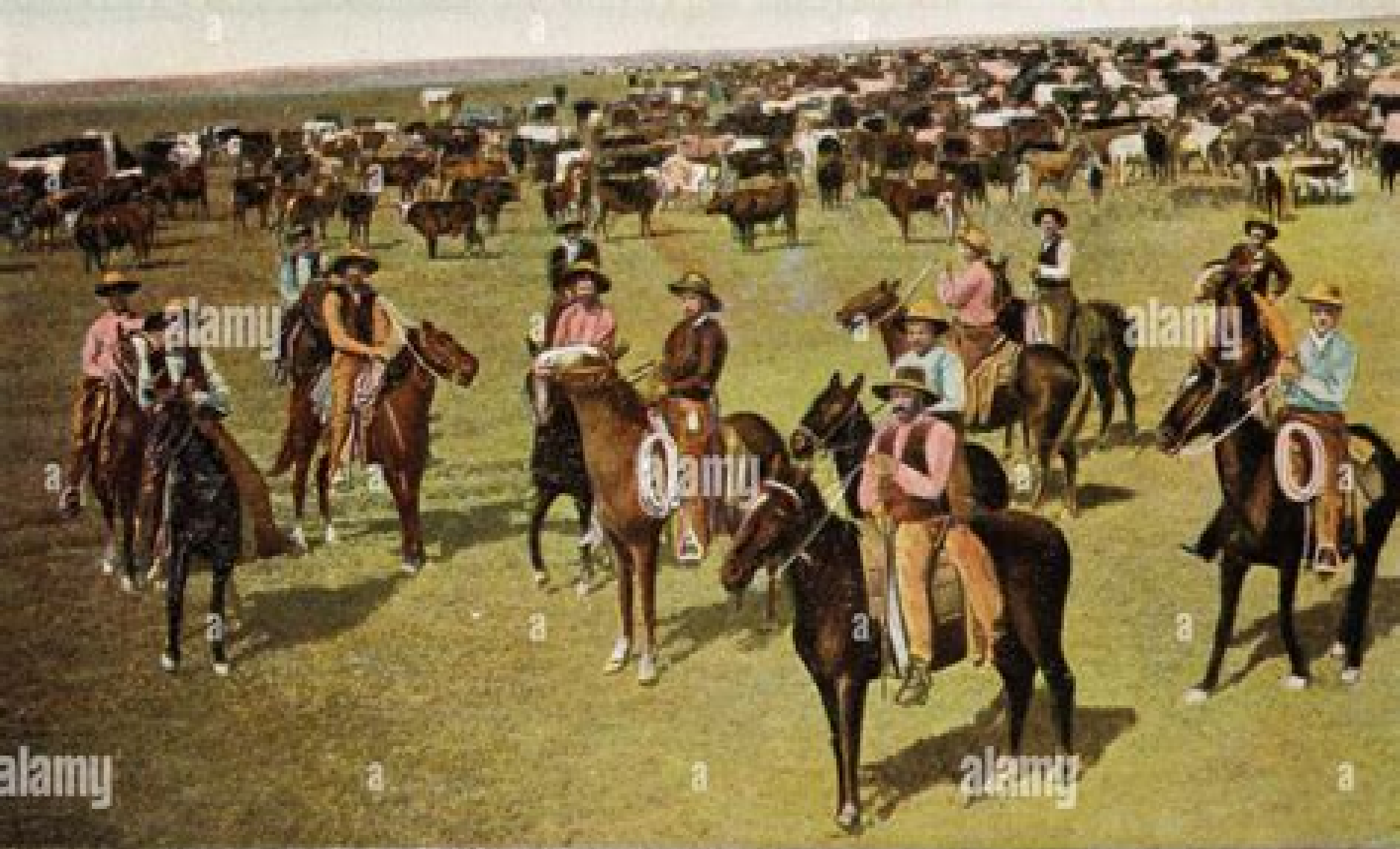
A "ROUND UP" IN THE CATTLE COUNTRY.