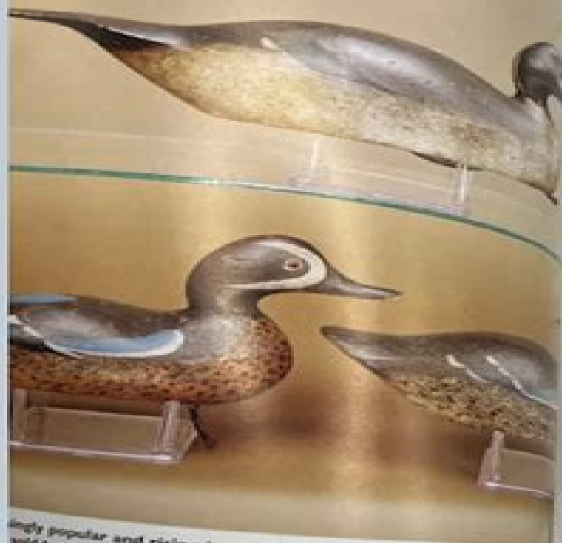
Increasingly popular and rising in cost are fine examples of Merganser. The one (top) that went to a happy buyer for $8,500.00 and a pair of ducks (bottom) that sold for $6,250.00.