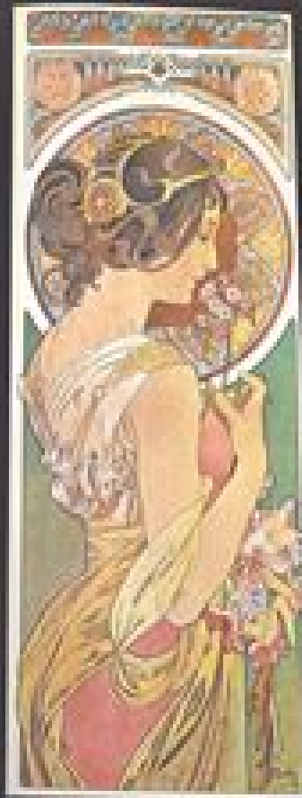
178. A FINE FINE FINE FINE FINE, 1904, BY J. M. W. TURNER, 1804