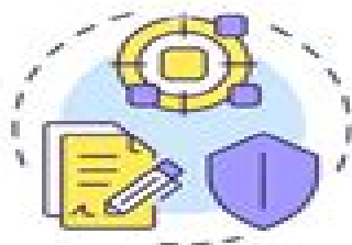
Reliable Audit Trails