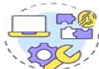
Integration With Forensic Tools