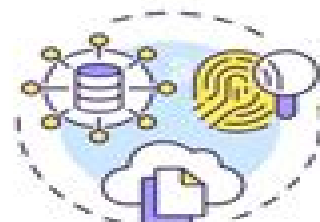
Evidence in One Place