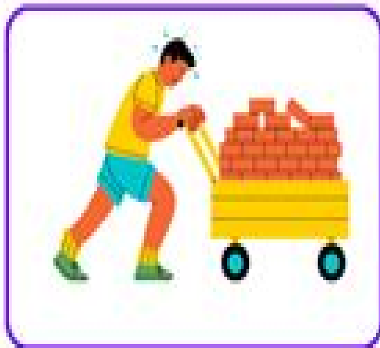
Newton's First Law of Motion

The Laws of Mechanics are fundamental principles that describe the behavior of physical bodies under the influence of forces.